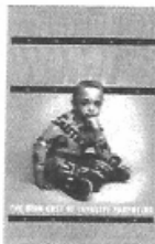
From A NATION OF WIMPS by Hara Estroff Marano (to be published by Broadway Books, 2008), reprinted with permission.

To consign children to the pursuit of perfection is to trap them in an illusion. Like the anorexic literally dying to be thin, perfectionism consumes more and more of the self. Among the many paradoxes of perfectionism is yet one more: It is ultimately self-destructive to devote all one's psychic resources to oneself. ▀